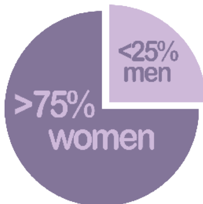
Statistic from LNHS administration

empowerment in male-dominated careers is important, female empowerment, in general, is a key focus, and some of the girls at Liberty North have recognized that.